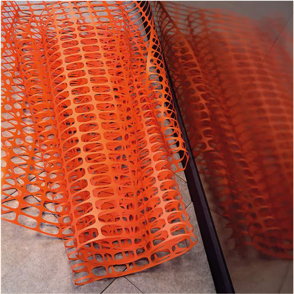
'Daily #9', 2009