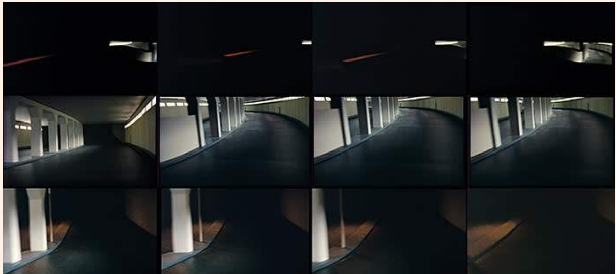
From the film 'Tunnel', 1999

TD In the beginning, it came from a completely different idea. I noticed that the discussion of my work was focusing on whether photography “lies” or not — that was in 1998, when digital photography was just about to take over everything. I found it a very limiting way of talking about pictures. I thought, OK, I need to do something to emphasise other aspects of my practice than just, “How real does it look?” And for me, the moment when you stand in a studio and something is built is a very peculiar one. You experience the fragility of everything, much more than you notice it on the picture. You know that you cannot sit on the chair, and you cannot use these things as things. But they still, to some extent, do what they’re supposed to do. And I just wanted to get more of that feeling of, like, you’re standing in the studio in this environment. So I thought, OK, if I move the camera through the space, rather than have it provide like a window on to the space, that would probably redirect the perception of the work. So the most natural thing was, of course, to move through spaces that are built for being moved through, like a tunnel. I had already developed the idea of making a movie of a succession of different tunnels, morphing into each other. About three months later, Lady Di died, so it wasn’t originally about that event, but at some point it was inevitably about her.