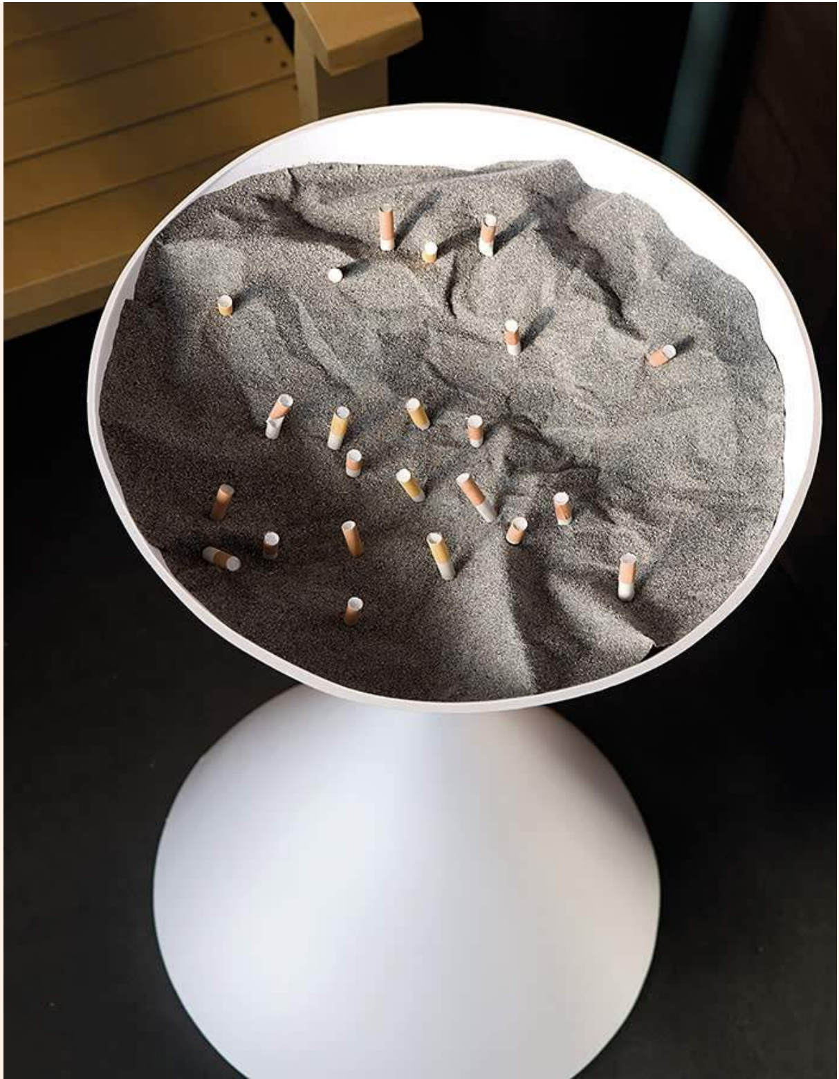
'Daily #2', 2008