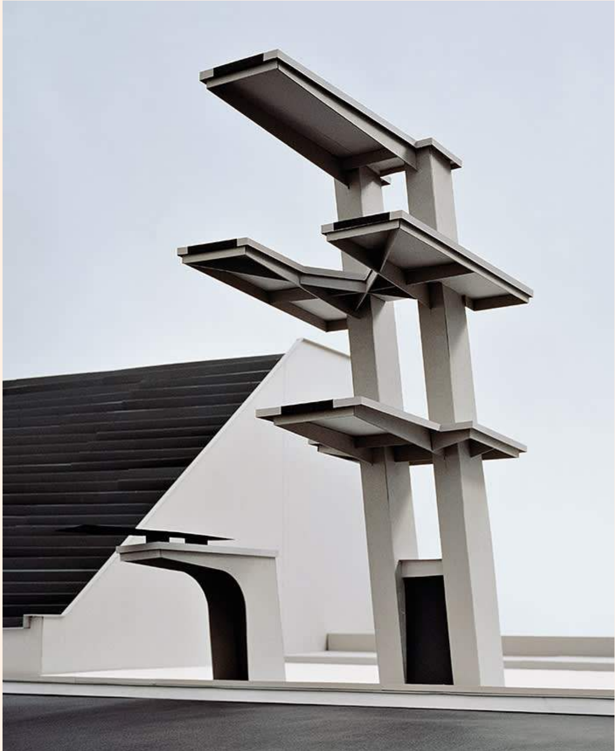
'Sprungturm/Diving Board', 1994

TD This is a smallish model because the studio was so small. I couldn't do it 1:1 or I probably would have ended up in the Guinness Book of World Records .