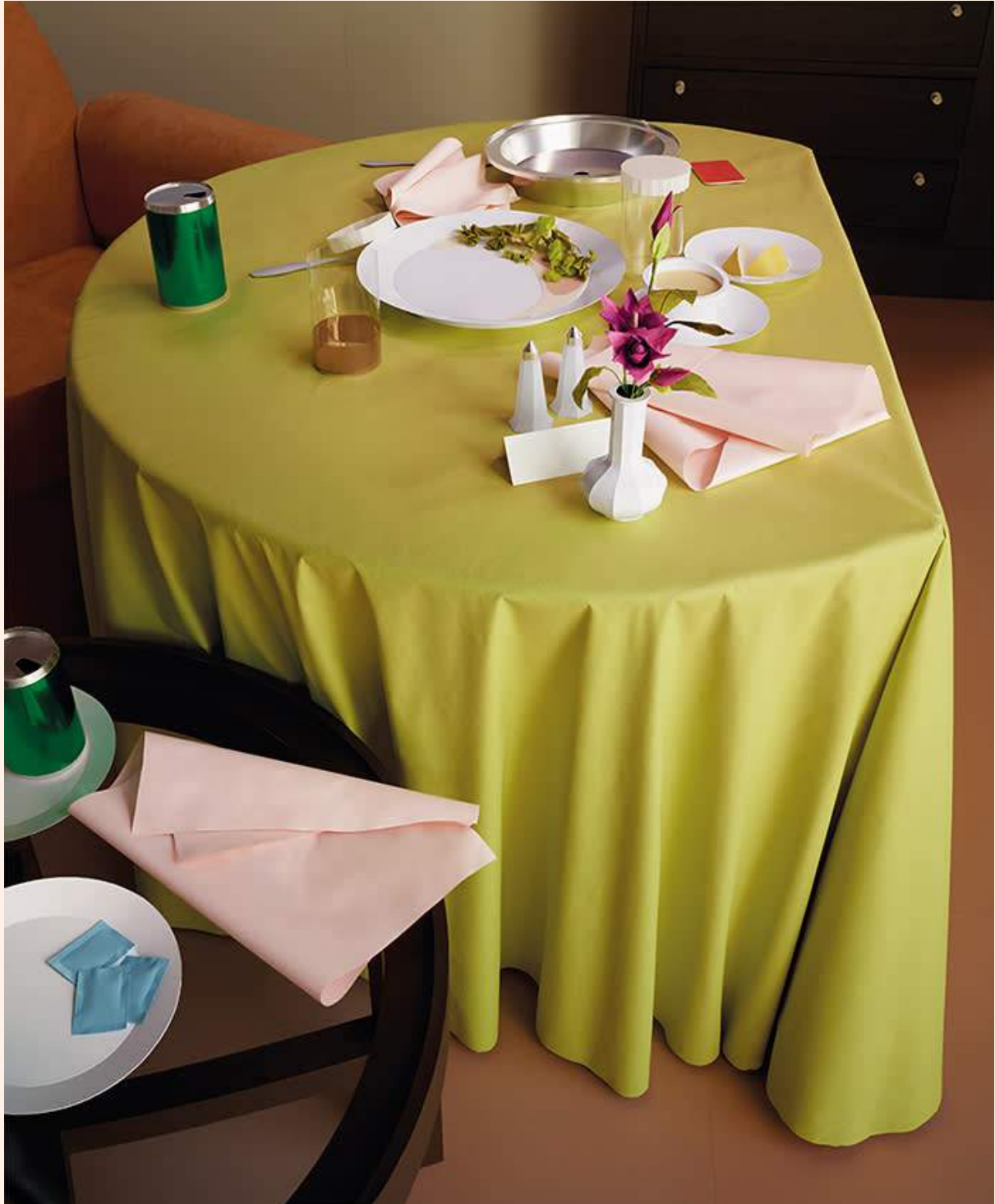
'Junior Suite', 2012

TD I just realised that those pictures for me are my own, even if they’re also part of the public consciousness. So your memory intersects with the collective memory.