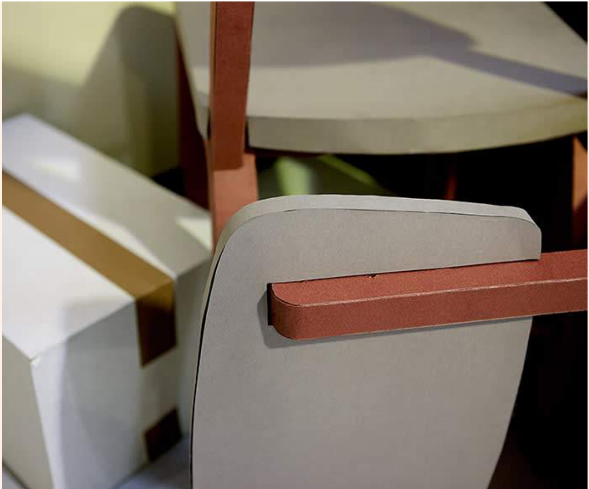
Detail from the video 'Pacific Sun', 2012